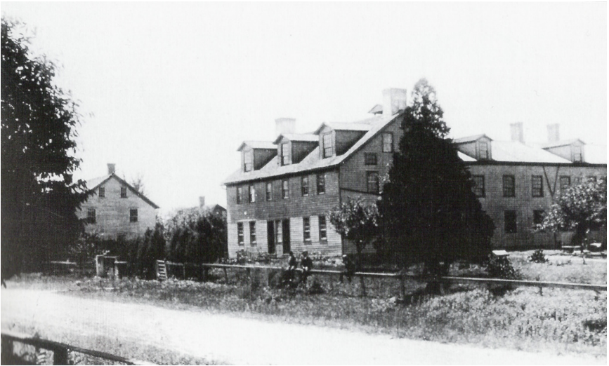
North Union Center Family dwelling house