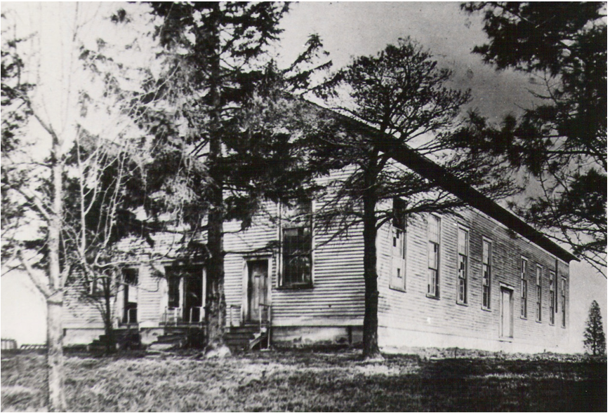
North Union meeting house

(From the collection of The Shaker Historical Society, Nord Library, Shaker Heights, Ohio)