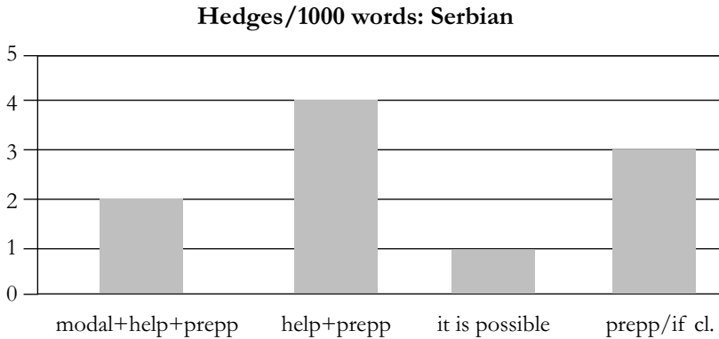
Fig.3. Linguistic items serving as hedges in Serbian corpus data