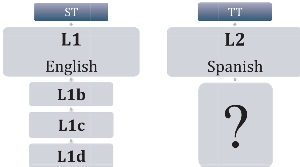
Figure 1. Representation of the third language in the ST

These two examples have been taken from the guidebook of Morocco. The first one's third language is Moroccan ("haram"), which has been included in the ST with an equivalent of the word in English (L1). Moroccan is, therefore, the third language (L1b). The second example, on the other hand, includes two different third languages: Spanish (L1c) and French (L1d), for which an equivalent in the L1 has not been included.