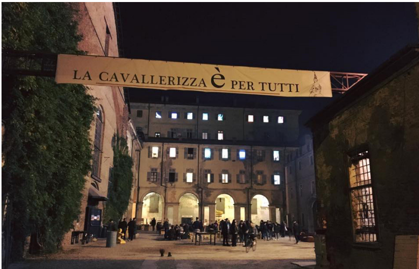
Fig 4. «Cavallerizza is for everybody» at the squat's entrance

Cavallerizza Reale is a building complex located in the city centre of Turin. Its construction started in the Baroque Age as a part of the Savoia's Zona di Comando and is as such part of the UNESCO world heritage site 'Residenze Sabaude'.