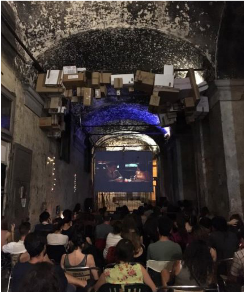
Fig 7. A cinema night

speak to a small part of the population.