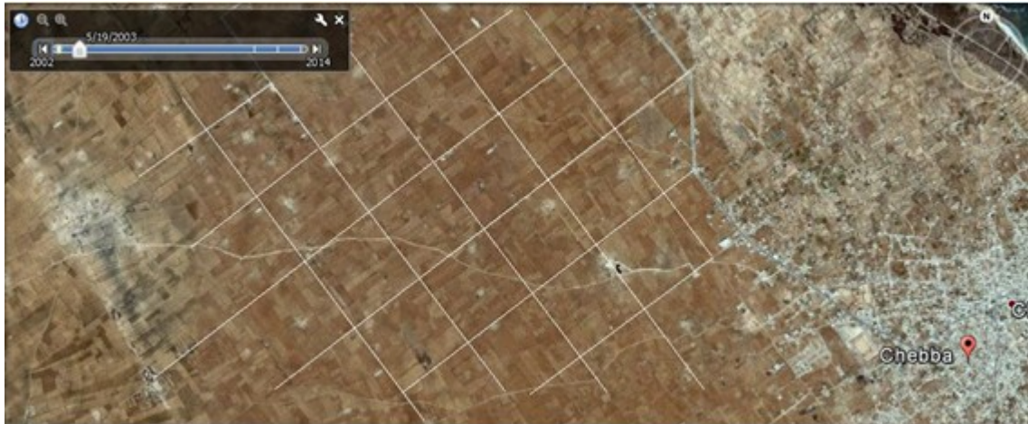
Figure 8 – The centuriation near Chebba in Tunisia. The grid has a size of about 700 m.

Another example of centuriation is given in the Figure 7 for the land near Cesena. And in the Figure 8, an example of the centuriation of land in Tunisia is shown.