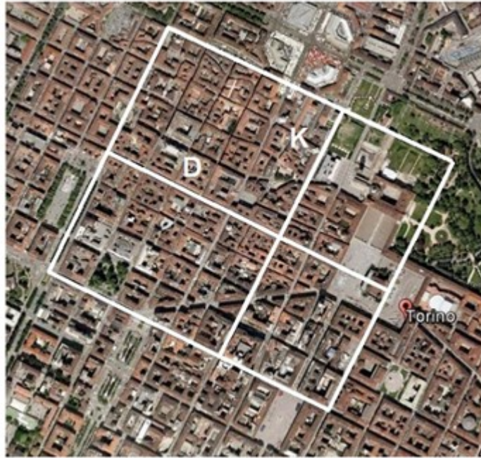
Figure 1 – Romans planned military castra with a precise regular scheme, based on two main axes, crossing at right angles at the center of the settlement. These axes are known as Decumanus (D) and Kardo (K). Sometimes, a castrum evolved in a colonia and then in a town. Torino is an example of this evolution, that was born as a Julius Caesar’s castrum. The Decumanus is today Via Garibaldi. It is crossed by Kardo, which is Via di Porta Palatina, at the central point of the town, the umbilicus soli. In this Google Earth map, we can easily see the rectangle of the Roman town, composed of several insulae. Note that the orientation of the Decumanus is not coincident to East-West cardinal direction [3]. At the ends of Kardo and Decumanus, four gates existed, but only two remain.