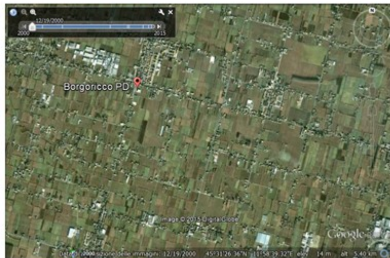
Figure 4 – Position of Borgoricco, a village located in the grid of centuriation of Fig.3.

In the central part of the grid of Figure 3, we find Borgoricco. Figure 4 shows this village and the country around it, obtained from an image of Google Earth time-series, which is best evidencing the centuriation. In this manner, we can use the satellite image to mark Decumani and Kardines of centuriation. This had been made to have the Figure 5. In the following Figure 6, the measurements of some distances are given too. In the Figure 5, we can see remains on the "limites intercisivi". The internal arrangement of the centuries consisted of 20 rows of fields, 35.5 meter wide, in the direction of Kardines, and internal "limites intercisivi", parallel to decumani [18]. The centuriation grid formed in such a way, was used for cultivations, but also for pasture.