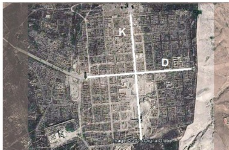
Figure 2 – Another Roman colonial town as seen in a Google Earth image. It is Timgad, in the Aurès Mountains of Algeria, founded by Emperor Trajan around AD 100, with the name Colonia Marciana Ulpia Traiana Thamugadi. Located about 35 km East of the town of Batna, the ruins are clearly showing the grid plan, based on Decumanus (D) and Kardo (K). Here, the Decumanus is at a small angle with the East-West cardinal direction [4]. The arc of Trajan is at the west end of Decumanus.