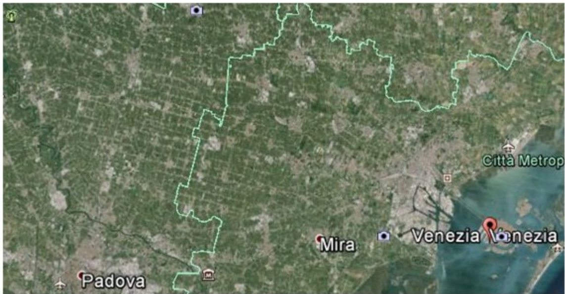
Figure 3 – In this image from Google Earth, note the regular grid of roads created by the Roman centuriation.