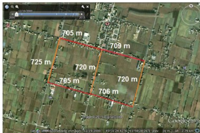
Figure 6 – Here the measures of Borgorico centuriation.