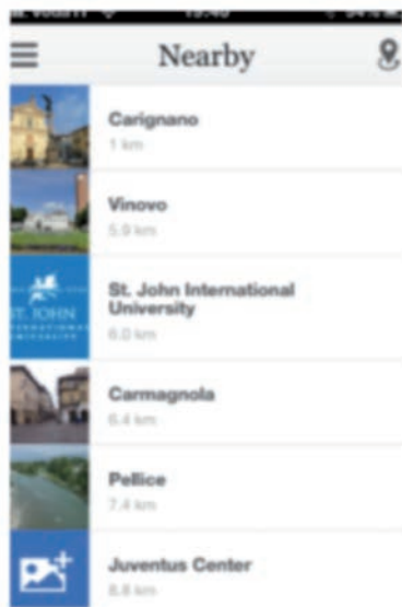
Figure 4. The Nearby feature on iPhone device.

But a true, "intelligent access" has to provide to you information you need, or tailored for you: nowadays, thank to information available e.g. on social networks, particular interests of any visitor can be saved and considered. Not only "where you are" is important, but also "who and how you are", because in the information sea you should find what you are really interested to know. Of course, this goal requires a great work on ontologies that have to cross with "social" data, very heterogeneous: each user has the right to receive "his ownr" information output.