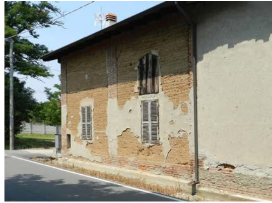
Fig. 2. Urban building in Frugarolo (Alessandria, Italy).