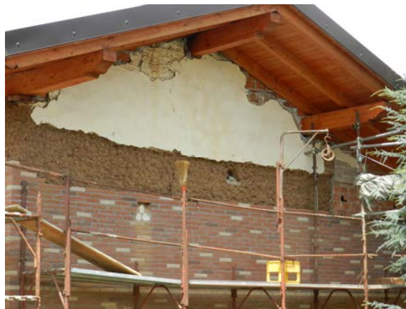
Fig. 3. Application of an external coating on an earthen building in san Giuliano Nuovo, (Alessandria, Italy).

Earthen building techniques have become, since the second world war, a synonym for poverty, marginalization and, for that reason, no longer used for the construction of new architectures and progressively hidden and/or replaced in the older buildings [9] (Fig. 3).