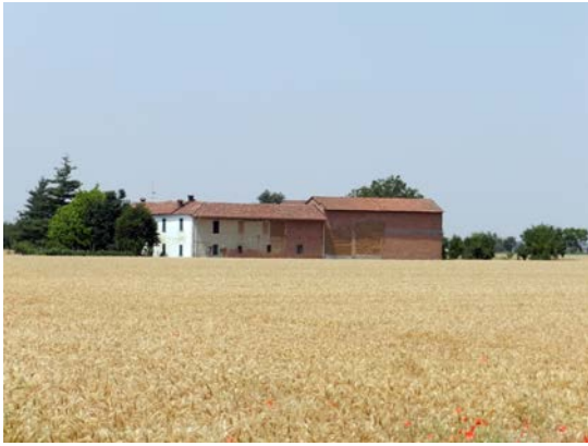
Fig. 1. Cascina Ravazzi in Frugarolo (Alessandria, Italy).

Unfortunately, the earthen buildings, abandoned because they were considered unhealthy and unstable, but, above all, because they were incompatible with the concept of modernity which people aspired to, for a long time have been placed in a situation of great vulnerability and are nowadays often severely compromised [10]. (Figs. 2).