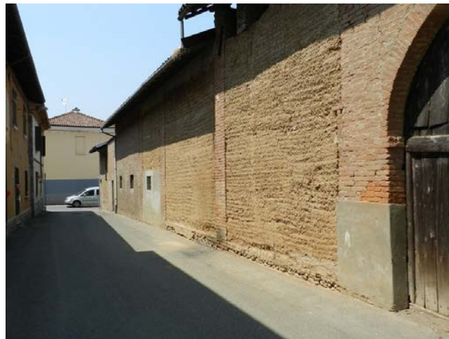
Fig. 4. Urban building in Fresonara (Alessandria, Italy).

The preservation of the surviving structures, which are evidence of a material culture, is closely related to the protection of the tangible or intangible cultural heritage, illustrated by these buildings and these places. The Piedmont Region moved in this direction enacting the Regional Law 2/2006 «Rules for the enhancement of the earthen constructions», through which it intended to officially confirm the importance and the value of these assets. It expressly manifests the will of the Region to engage itself in the «conservation and enhancement of earthen buildings through the promotion of knowledge of existing assets and the financial support for recovery actions which ensure the best use of the construction», trying to end their transformation and/or total removal.