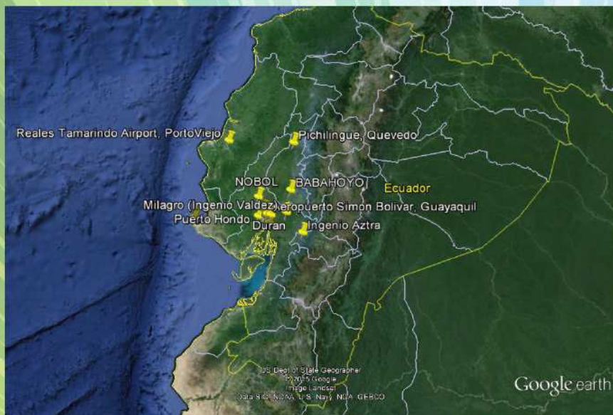
Figure 1. Position of the INAMHI's Automatic Weather Station in South of Ecuador