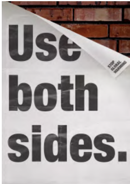
figure 5: Use Both sides, selected by Good 50x70, 2006.