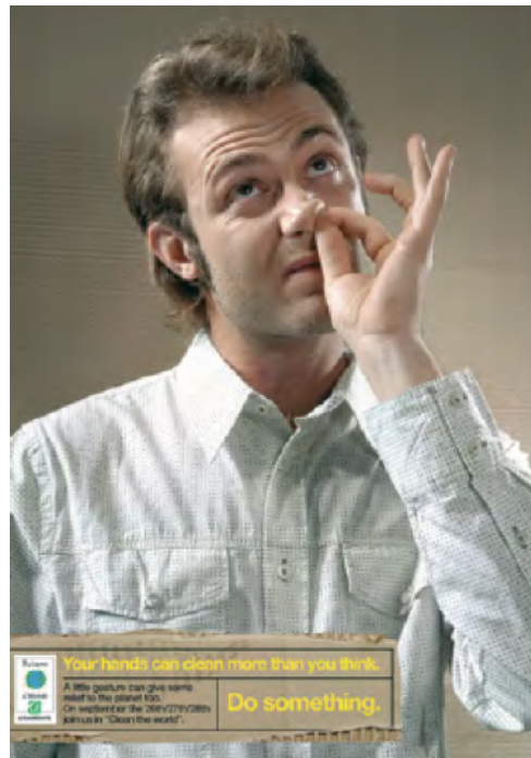
figure 1: Your hands can clean more than you think, Advertising Agency: Forchets, campaign Legambiente Italy, 2008.

The way today's technology and the Internet are pervasive, and they have made communication immediate and multidirectional, so much so that the traditional dichotomy between sender and receiver has been revolutionized. A plethora of messages combined with ever interchangeable roles is making social and environmental communication increasingly horizontal, raising debates and contentions. The generally used media have broadened out to encompass the variably conventional online channels, such as web pages, corporate blogs and social media (facebook, twitter, youtube etc.) [4]. Social networks can be set up to be an excellent means of disseminating and promoting environmental policies implemented by companies with hands on environmental communication, although such an option does not necessarily make them socially responsible.