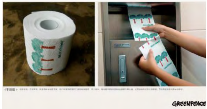
figure 6: Tree Paper toilet By Greenpace 2010.