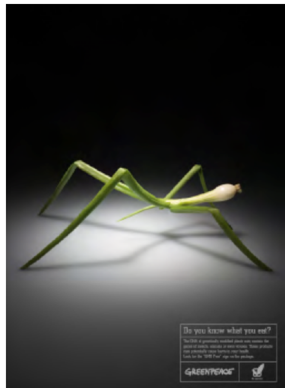
figure 4: Do you know what you eat? By BBDO Moscow for Greenpeace 2011.