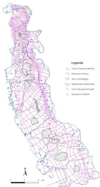
Figure 2: Water table aquifer Map

gravely-complex and sometimes in morainic complex, extends itself over the plain area. Only the deeper part of the morainic structure is interested by this aquifer, while in the superficial region secondary perched aquifers can be found. The groundwater flow pattern is shown in Figure 2