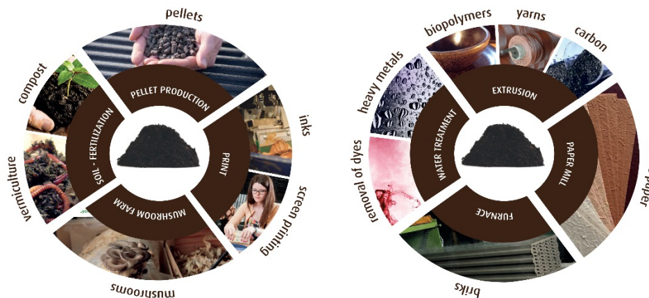
Figure 3 – Application fields of exhausted SCG