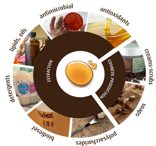
Figure 2 – Application fields of oils

Some universities chemically analysed SCG, pointing out a high presence in them of phenolic compounds with significant antioxidant activity [11; 12; 13; 14], suggesting the possibility of using the waste as a resource of natural antioxidants or as a source of polysaccharides with an immuno-stimulant activity [15]. By extracting the lipids with supercritical fluid extraction (250 bar at 50°C) they were able to develop new cosmetic formulas [16].