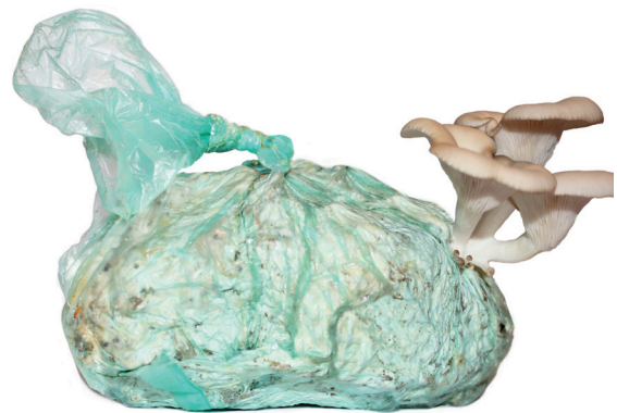
Figure 5 –Experimentation with mushrooms

Even exhausted substrate, that comes from mushroom production (consisting of SCG, spent grain and mycelium), can have different uses in its end of life: it could be hot pressed to produce acoustic panels, or micronized and used as an additive for the production of recycled paper, as above, but also used for vermicompost production. It can also be used to produce pellets for domestic heating. It should be pointed out that the combustion shall not be the first solution when one talk about waste disposal, especially when waste still has a productive value and, consequently, a market one.