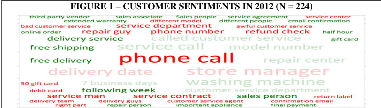
FIGURE 1 – CUSTOMER SENTIMENTS IN 2012 (N = 224)

In the year 2012, Sears failed customers in several areas; one area with reoccurring issues is service. There were complaints about Sears’ service department, specifically with service calls, contracts, center, and customer service agents. Customer sentiments revealed that customers had awful customer service experiences with Sears’ employees.