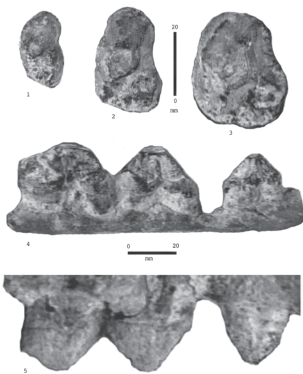
Plate 2.— Megalochoerus khinzikebirus from Gebel Zelten, base of the Middle Miocene, Libya.