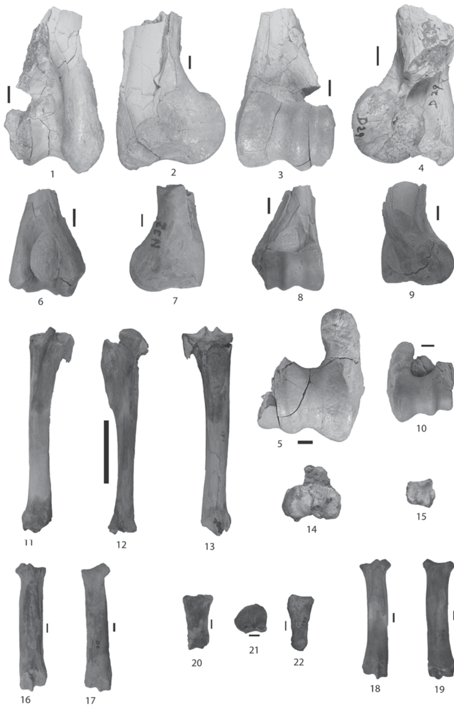
Plate 3.—Suid post-cranial bones from Gebel Zelten, base of the Middle Miocene, Libya. (Scales 10 mm except for tibia, 10 cm).

1-5. D 29, left distal humerus, Megalochoerus khinzikebirus (posterior, medial, anterior, lateral and distal views).