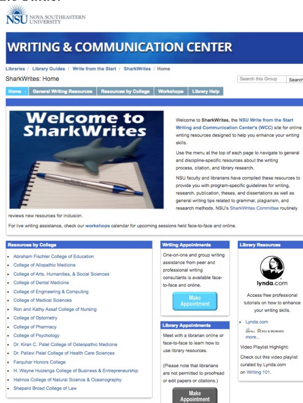
Image 1. Screenshot of the NSU Writing and Communication Center's SharkWrites LibGuide.

The main page offers general information about the WCC and the SharkWrites platform. It provides links to each of the college's specific resources (see below), as well as opportunities for students to 1) make an appointment with a WCC consultant, 2) make an appointment to meet