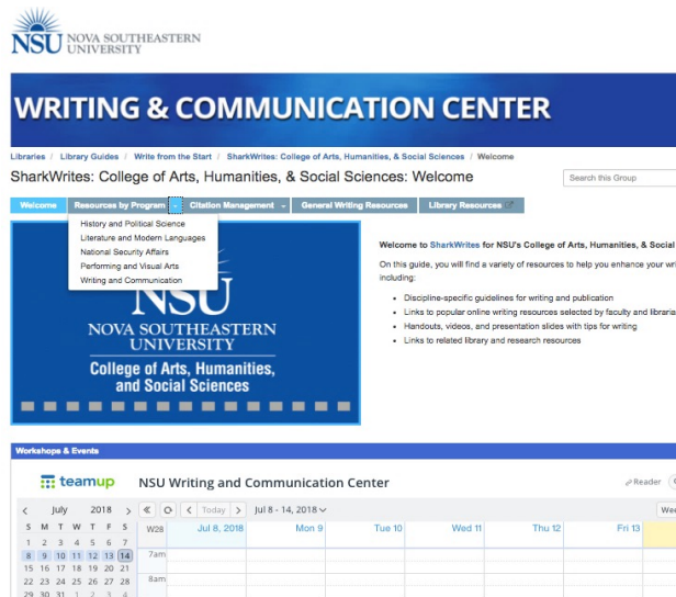
Image 3. Screenshot with dropdown menu options on the College of Arts, Humanities, and Social Sciences' resources page

Each of the departments within the college has its own webpage that provides resources faculty have chosen and are appropriate to its disciplines. The Department of Writing and Communication has resources on the Writing and Communication Center, as well as APA Style and MLA Style, while History and Political Science and Performing and Visual Arts both have extensive information on the Chicago Manual of Style.