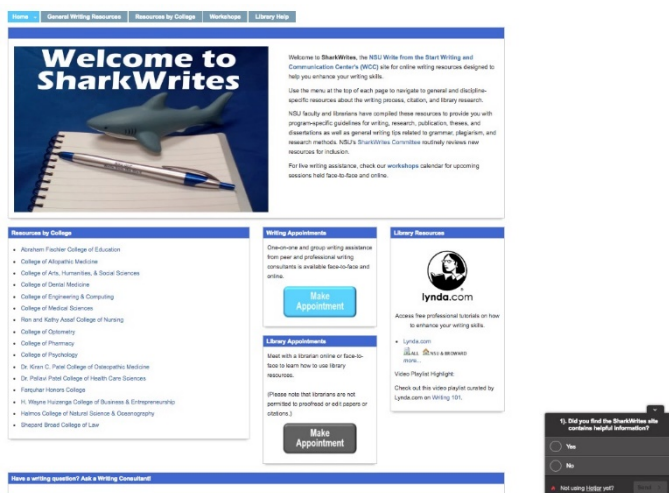
Image 6. Screenshot of a SharkWrites main page with survey in bottom right corner.

The survey appears each time a student accesses the main page, and it asks the following questions: