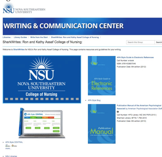
Image 2. Screenshot of the NSU Ron and Kathy Assaf College of Nursing's resources page

While all of this information is certainly useful, NSU's WCC leadership believed that providing college-specific pages would reduce the amount of searching students would have to do to locate appropriate resources and it could possibly prevent them from using resources not related to their programs and classes. For example, faculty in NSU's Ron and Kathy Assaf College of Nursing are adamant that their students only use the APA Style Guide and accompanying APA Style Blog for research projects and presentations. They want their students to avoid using popular websites like the Purdue OWL and UNC Chapel Hill's Writing Center because they recognize the APA Style Guide as the sole authority on its style—it provides the most detailed, accurate, and up-to-date information on how research is to be presented. Therefore, nursing faculty asked the WCC to only provide links to the two resources produced by APA. A screenshot of their resource page can be seen below.