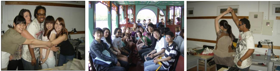
Figure 6: Images of lifelong relationships that developed throughout this experience

Feedback from both the CMU students/faculty and the NCUT students/faculty was overwhelmingly positive. The rich relationships that developed are best summed up by one comment from a NCUT student who said, "I wish that our children could marry, and that we could grow old together in the facility that we designed." The mutual friendships that developed are shown in Figure 6 by diverse members of three teams.