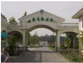
Figure 1: Green Acres Nursing Home

Initially, each student developed their conceptual ideas, which were presented to their team members. One design was selected for development by the team over the duration of the remaining ten days, where team collaboration occurred on schematic sketches, renderings, material selections, sample boards, and two- and three-dimensional models, as shown in Figures 1-4.