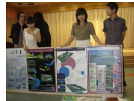
Figure 4: Presentation to Committee

Students presented their final design solutions to a committee from the nursing home that consisted of the director, residents, and staff members. One project was selected by the committee for future development, although all design solutions had highly innovative, successful elements incorporated into the final solutions. The recurring design elements incorporated in all solutions included sustainability principles such as green space, central courtyards, roof gardens, southern exposure for private residences to promote positive light patterns throughout the day/night; walking paths; small residential environments that opened into shared public spaces such as sitting areas; barrier-free accessible spaces; and contemporary Asian architectural influences, as shown in Figure 5.