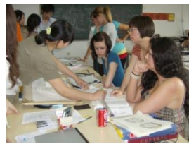
Figure 3: Team Production Time