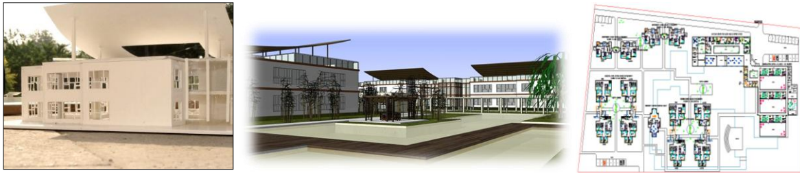
Figure 5: Project model and CAD drawings of the Beijing Facility

Upon their return to the U.S., the CMU students had five more days to complete the remaining elements of the intergenerational center through the design development and contract document's phases.