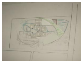
Figure 2: Conceptual Model