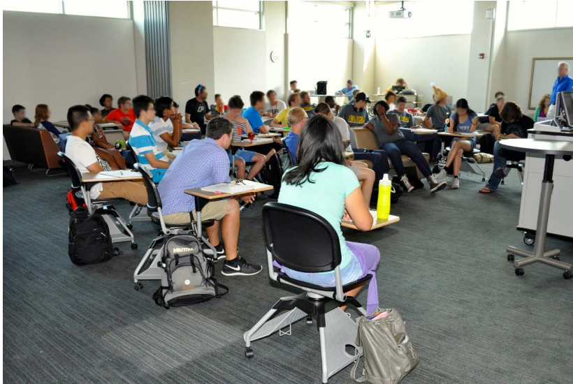
Figure 3. Classroom use of flexible furniture

Communications into the curriculum, and a seminar course. The diverse nature of the instructors, content, and delivery among these classes allowed students to reflect on the role of the learning space across a range of learning experiences. This population was chosen because they would be experiencing a wide variety of pedagogical approaches and instructors (from traditional lecture to extended problem-based learning sessions) in the same 21 st century learning space.