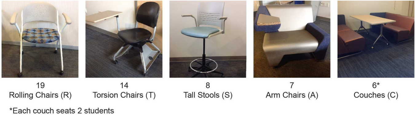
Figure 1. Seating options in flexible classroom

HDLR, hence we had free access and control (or “ownership”) of the space. Second, the learning space is one of the very few 21 st century learning spaces that existed on the Purdue campus at the time the study began.