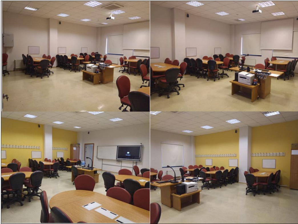
Figure 1. Views of the classroom