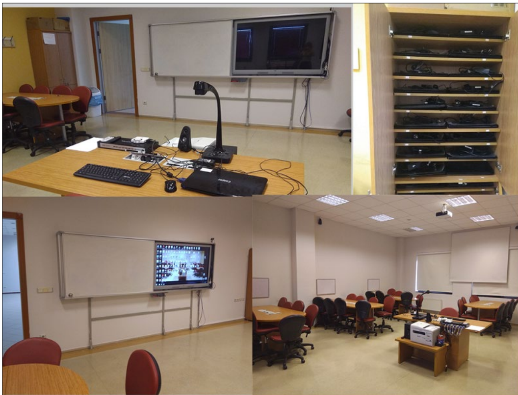
Figure 2. Equipment of the classroom