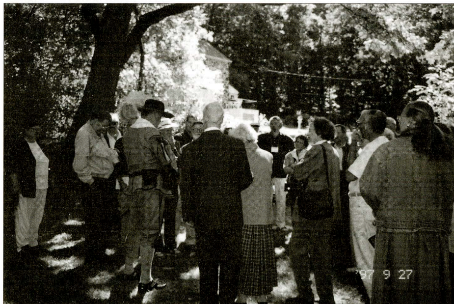
Members of the 1997 SAHS tour to the old Swedish places in the Philadelphia area listen to the guide at the Lower Swedish Cabin at Drexel Hill.