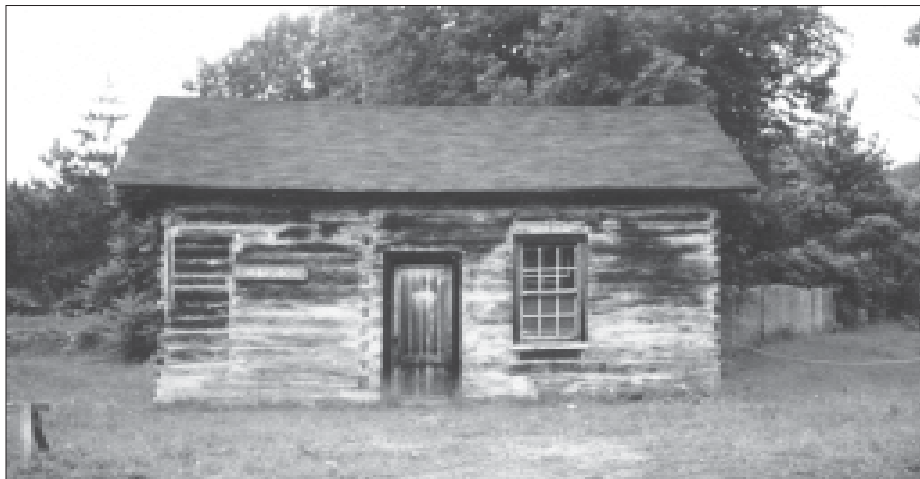
The Early Settler's Cabin in Marine-on-St. Croix, Minn.

sonal satisfaction, my thanks to family, and joy was unlimited. What a dream come true! All of my personal family had been to see the cabin, with the exception of one granddaughter and her three small children.