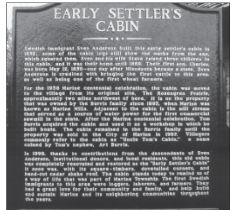
The memorial plaque.