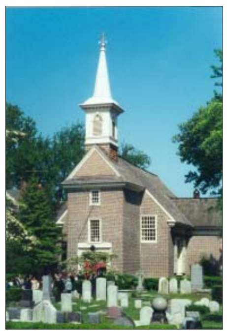
Gloria Dei in Philadelphia.

The Swedes that formed these congregations over the five to six generations between the original colonists and the Revolutionary War had scattered around the Delaware Valley. Many others began to join the westward movement of their fellow Americans to seek their fortunes elsewhere. Intermarriage became much more common, and the Swedish language had all but disappeared. Original surnames sometimes disappeared or spellings were altered. Records and histories took little notice of the fate of the presence of these early Swedes. By 1838, the 200<sup>th</sup> anniversary of New Sweden, there was no mention of this event