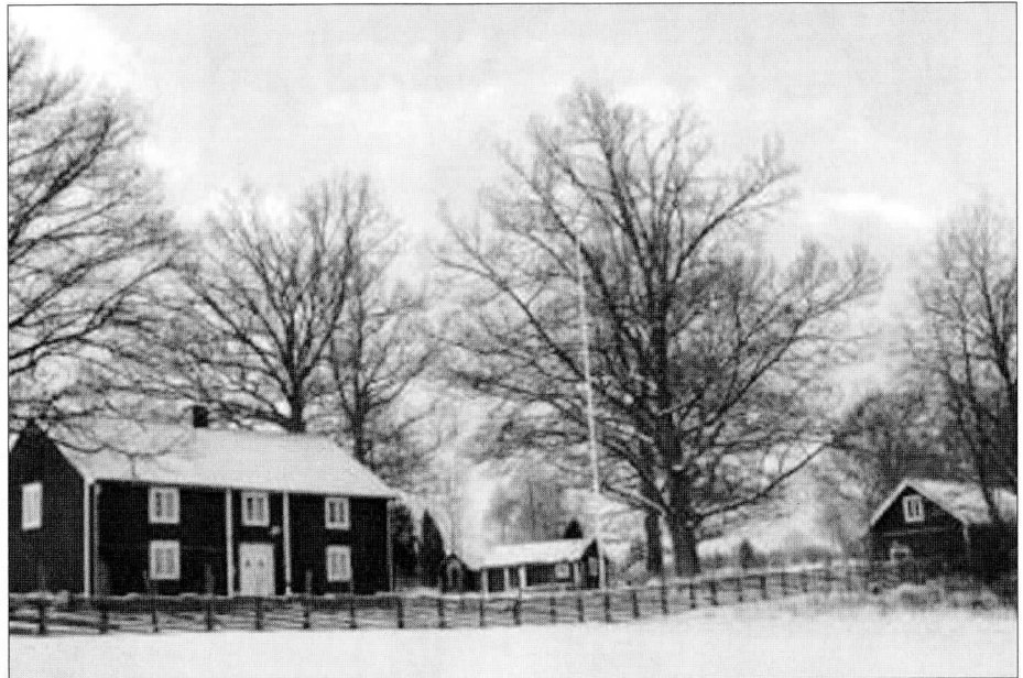
A farm in Alseda during the wintertime.