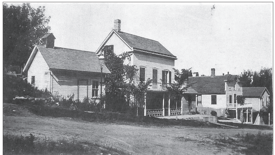
4th Street West, Carver, Minnesota.