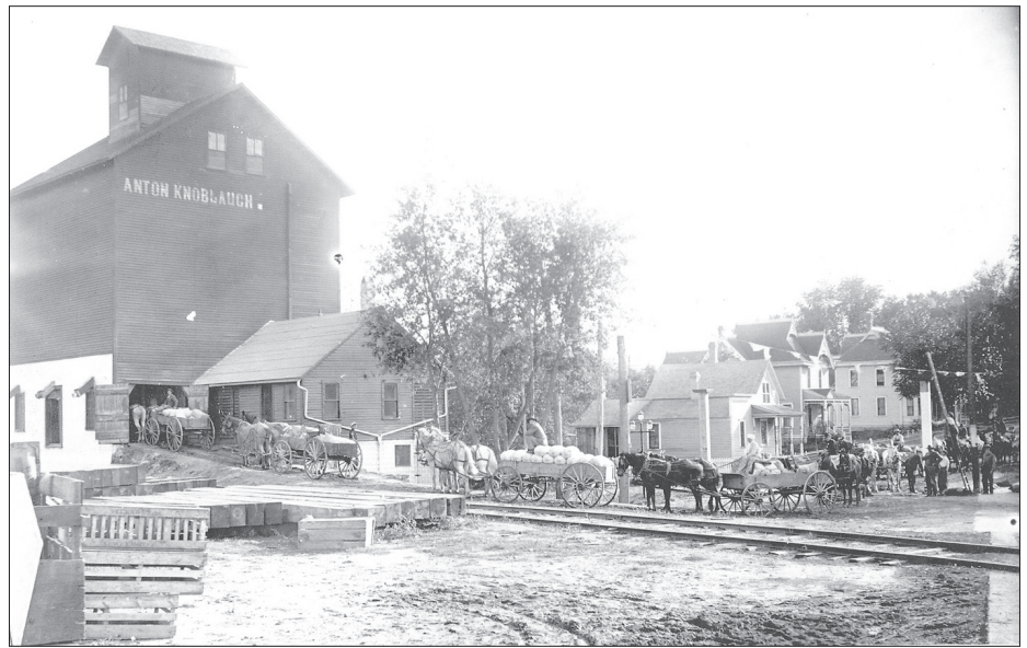
Delivering grain in Carver, Minnesota