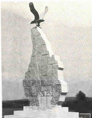
The Kinship Monument