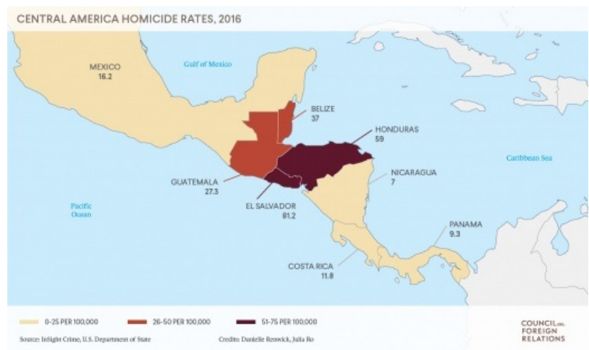
Figure 2. Renwick and Ro, 2016

gun violence and learning how to help people in an emotional crisis (Lerner, 2018).