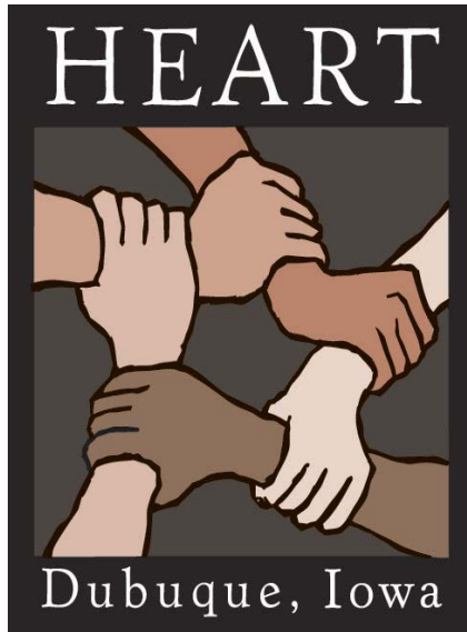
Figure 1 Dubuque's HEART program partners with schools

Livable Communities” award in 2010. As the city of Dubuque continued to develop and become more of a sustainability-minded community, it became increasingly important to the entire county to address this potential threat of lead to young children. Similar connections could be made in Davenport to local sustainability initiatives.