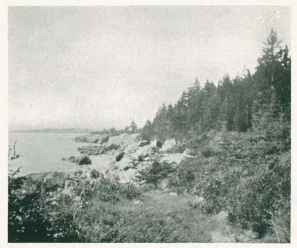
THE WEST SHORE