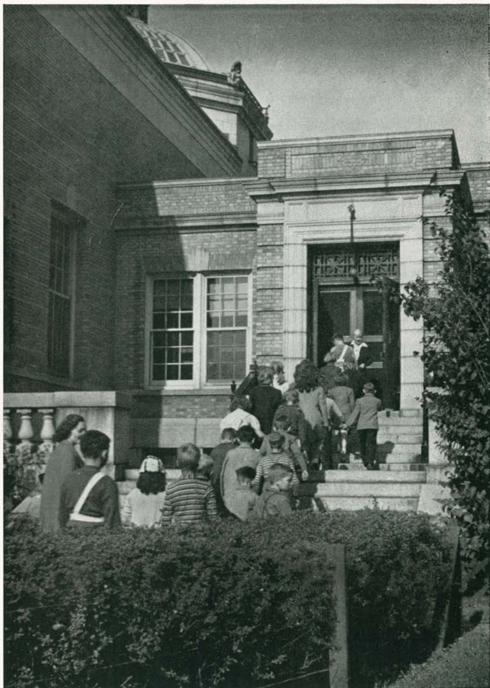
A school class and their teacher being received by the children's librarian at the children's entrance of the library. Thirty-five classes from grades three, four, six, and seven made such visits during 1951 as a part of their school course.