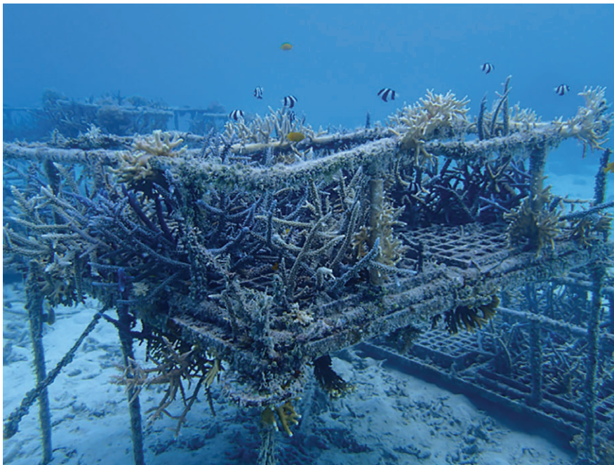
Figure 1. Acropora yongei assemblages at an artificial spawning hotspot at Sekisei Lagoon, Ishigaki Island, Okinawa, Japan.

To estimate the larval supply of a spawning hotspot, we determined the population density and genetic diversity of the pre-existing wild population because spatial distribution and cross compatibility of adult colonies determine reproductive success (i.e. larval supply). The target taxon in this study was an arborescent species, Acropora yongei Veron and Wallace 1984, which can dominate inner reef and lagoon areas of Indo-Pacific coral reefs. We compared population densities and genetic diversities of A. yongei populations between wild and artificial populations. For an artificial spawning hotspot, we used 4-year-old corals from which gametes were collected, fertilized, and settled on grid plates in 2011 (Fig. 1) (Suzuki et al.