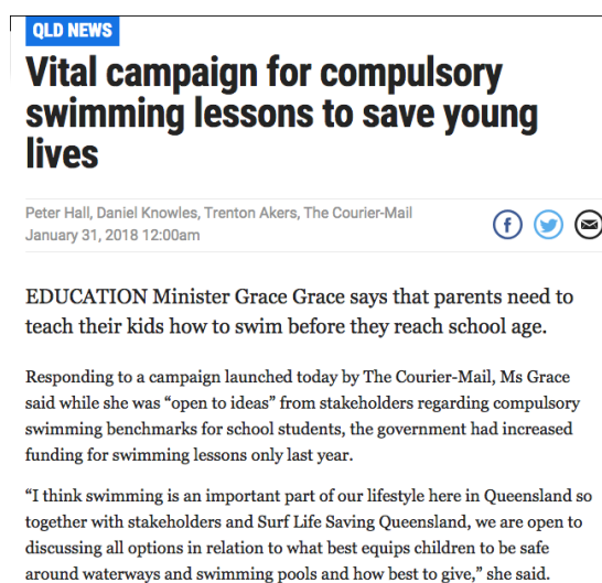
Figure 3. Community concerns appearing in The Courier Mail

More recently in the state of Queensland there has been a concerted campaign initiated through print media about swimming and water safety programs offered by schools. The Courier Mail newspaper and its regional centers ran a daily two-week campaign until there was some action by the government with a subsequent announcement in August of renewed effort in this area (see Figures 3, 4, & 5). The question arose then about the level of competency as perceived by the wider community and stakeholders.