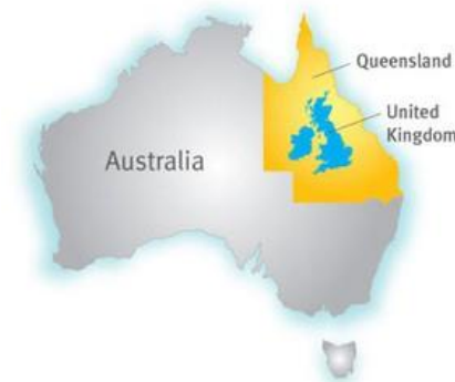
Figure 1. Map of Queensland, Australia with the UK and Ireland superimposed.

The Downs Little Lifeguard (DLL) program is based in a regional center 125 kilometers west of the Queensland state capital of Brisbane. Queensland is the second largest state in Australia and approximately 3 times the size of Ireland and the United Kingdom (see Figure 1). The climate is considered subtropical with almost half of the 5 million inhabitants based in the south east of the state.