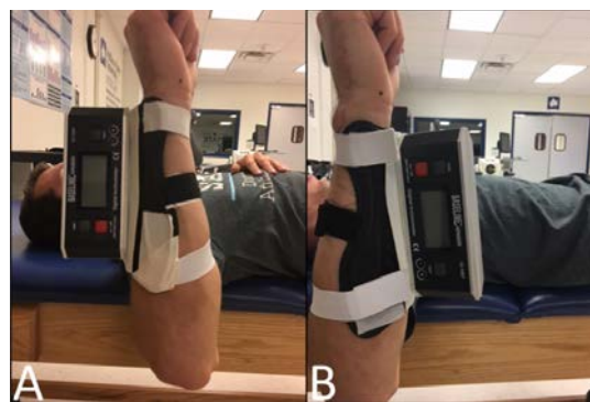
Figure 1. Purpose-built sleeve to secure digital inclinometer for glenohumeral external (A) and internal (B) rotation.

We utilized a digital inclinometer (Digital Inclinometer, Baseline Evaluation Instruments, White Plains, NY) to measure glenohumeral IROT and EROT ROM. The digital inclinometer has been found to have a high intrarater reliability for EROT (0.98) and IROT (0.97) of the GH joint. 10 Additionally, we created a purpose-built sleeve with hook and loop fasteners to secure the inclinometer to the participants for measurement (Figure 1).