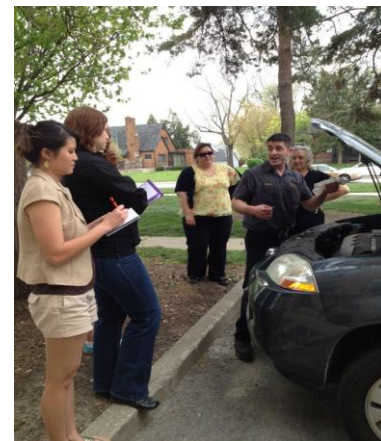
Learning how to become an empowered car owner and taking notes.