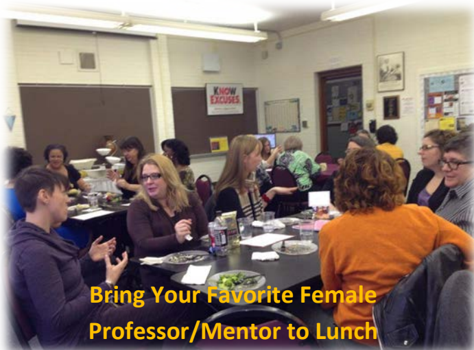
Bring Your Favorite Female Professor/Mentor to Lunch