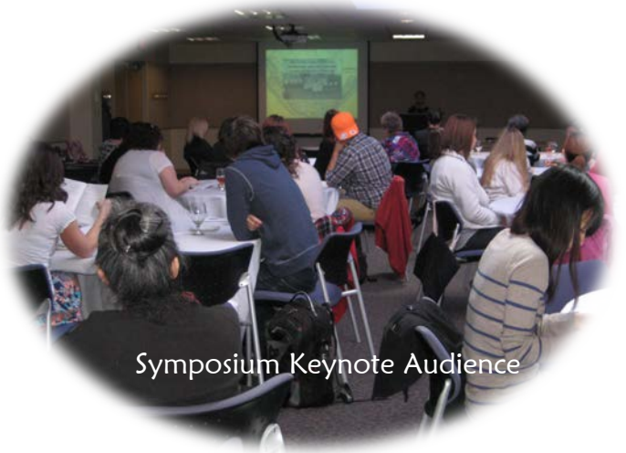
Symposium Keynote Audience