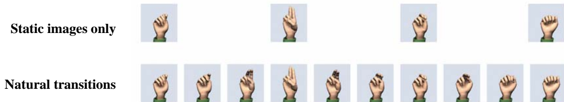
Figure 1: T-U-N-A: comparing the previous and improved approaches to fingerspelling display