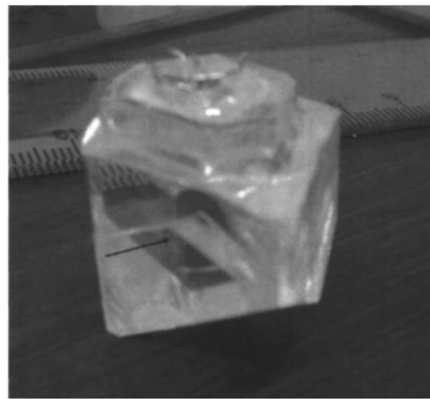
FIG. 3. As-grown KLuW crystal containing fractures with seed orientation along the c direction.

Table II lists the principal-axis parameters \alpha_I , \alpha_{II} , and \alpha_{III} and \phi for \text{KGd}(\text{WO}_4)_2 , 8 \text{KYb}(\text{WO}_4)_2 (Ref. 9), and KLuW crystals. In comparison with the values of \alpha_{III}/\alpha_{II} of KGdW and KYbW (8.3 and 6.5, respectively), the low value (2.8) for KLuW indicates that the thermal-expansion anisotropy is relatively weaker and thereby an optical-quality