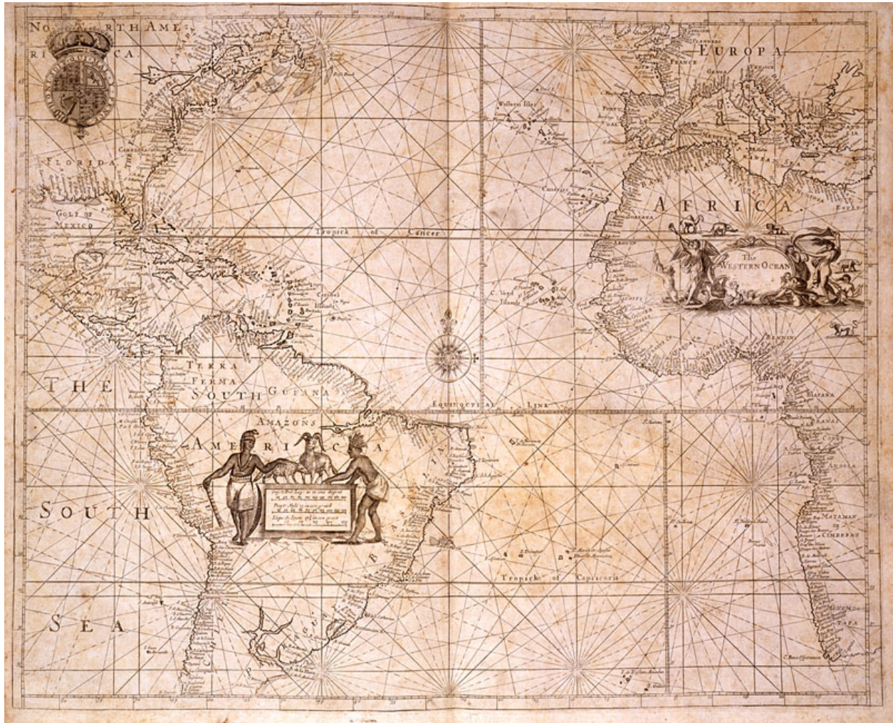
"The Western Ocean," The English Pilot: The Fifth Book (London, 1720)