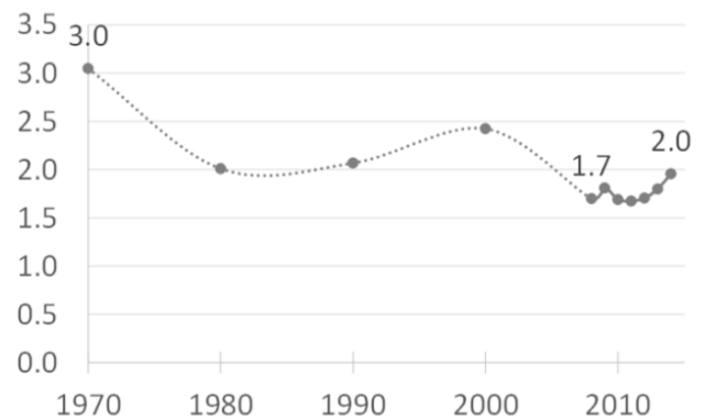
Figure 1. Women's Marriage to Divorce Ratio, 1970 - 2014

Sources: 1970-2000, National Center for Health Statistics; 2008-2014, U.S. Census Bureau, American Community Survey 1-yr est.