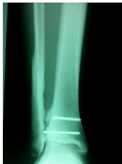
Figure 1. Radiograph revealing broken syndesmotic screws from previous surgery and fractured heterotopic ossification of the syndesmosis.

given the severity of symptoms and previous history of fracture, x-rays were ordered. Radiographs revealed a poorly healed Weber Type C fracture, two broken syndesmotic screws, and a fractured heterotopic ossification of the syndesmosis (Figure 1). With the revelation of the poorly healed fracture, the athletic training staff reached out to the patient's previous caregivers to obtain his medical records. In the interim, the patient was placed in a walking boot and issued crutches until he could be seen by the team foot and ankle surgeon.