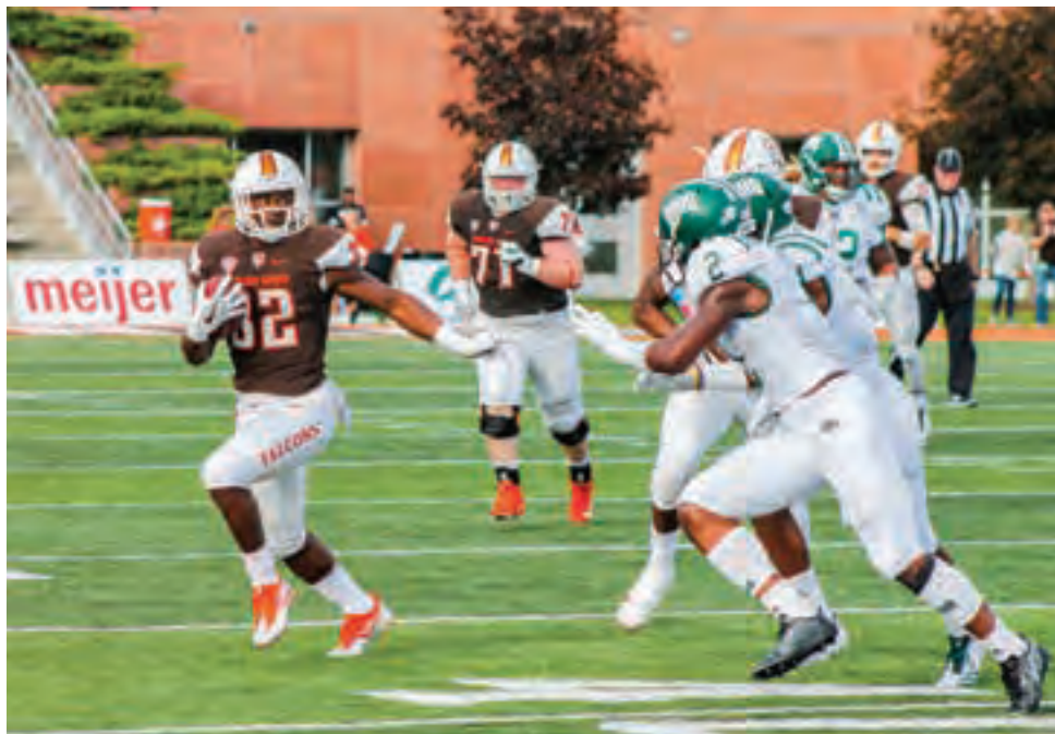
The Bobcats defeated the Falcons 48-30 in 2017.

The game is scheduled to kickoff at 2 p.m. Saturday. It will be broadcast on ESPN3.