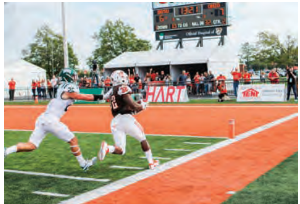
The Falcons will play the Bobcats under new coaching leadership this season.