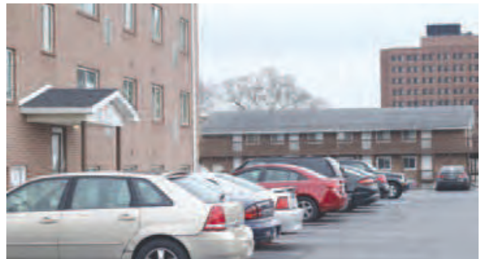
The University apartments are located near Offenhauer Hall.