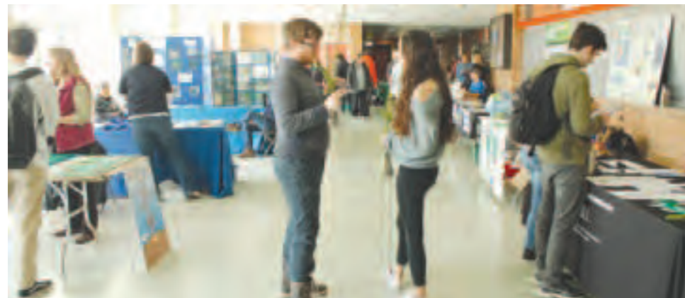
Organizations provided volunteer and internship opportunities.