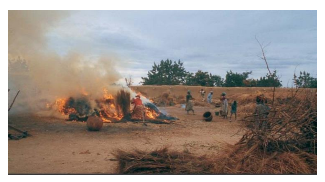
Figure 2: Goldner, Janet. Tending the Fire, 2005.