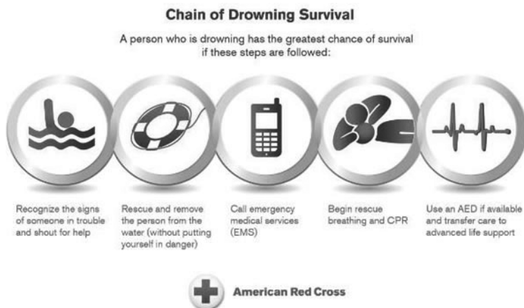
Figure 2 — Chain of Drowning Survival diagram.

Developed as a subsequent step to the Circle of Drowning Prevention, the Chain of Drowning Survival (Figure 2) was created to provide an easily understood series of actions that rescuers can take to mitigate the result of an aquatic accident or event involving a possible drowning. Research provides evidence that factors such as early recognition and early response can make a significant difference in the eventual outcome of emergency situations (Claesson, Svensson, Silfverstolpe, & Herlitz, 2008). In a specific example, a study by Quan and Kinder (1992) revealed that drowning victims whose submersion was limited