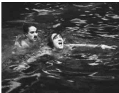
Figure 8 — Charlie Chaplin rescued a seven-year-old girl from drowning after she had been swept into the water from a rock while watching the filming of The Adventurer . Cropped screenshot from the film The Adventurer (Chaplin, 1917). Fair use.