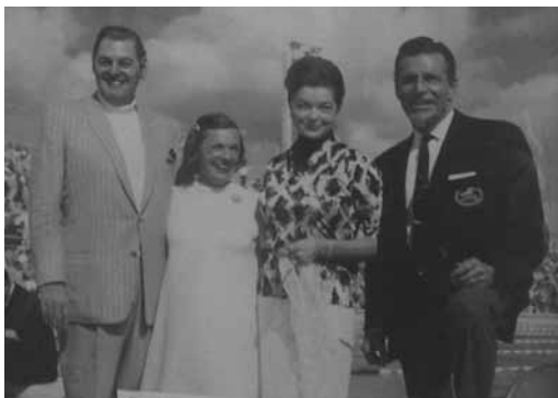
Figure 13 — Buster Crabbe acted in many Hollywood Films and was an Olympic swimmer. Johnny Weissmuller, Eleanor Holm, Esther Williams, and Buster Crabbe (from left to right). Photo of the original picture taken in the International Swimming Hall of Fame.

The literature search revealed several actors and actresses who died as a result of drowning. Actor Eric Fleming, starring in Rawhide , drowned in 1966 when his canoe capsized during the filming of a movie near the headwaters of the Amazon