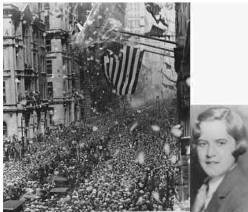
Figure 11 — Parade for Gertrude Ederle, the first woman to swim across the English Channel, coming up Broadway, New York City, with large crowd watching.

Eleanor Holm was an Olympic swimmer who also played in Hollywood films. At the 1932 Olympic Games in Los Angeles, California, Holm won her favorite event. Though she would appear in at least four films as herself, Holm (Figure 12) appeared in 1938 only in one Hollywood feature film, Tarzan’s Revenge , starring with Glenn Morris. At the 1939 New York World’s Fair, she did 39 shows per week at Rose’s Aquacade and cofeatured with Tarzan swimmers Johnny Weissmuller and Buster Crabbe (Wikipedia, 2008h).