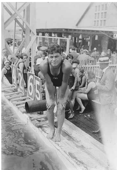
Figure 9 — Johnny Weissmuller, Hollywood star and Olympic swimmer, got an honorary appointment from the Santa Monica Lifeguard Squad as a lifeguard because he rescued a young boy.

Lake Michigan accompanied by his brother who was in a rowboat timing him. When they were a half mile from the shore, they heard a terrific explosion and screams of terror as a ferryboat began sinking into the water. Weissmuller jumped into the rowboat and rowed with his brother as fast as possible to the place of the accident. When they arrived, 85 children and their mothers were pinned under the waves in the wrecked ferry. They dived repeatedly into the lake, bringing up lifeless bodies. Of the 30 women and children the brothers lifted from the water, 15 were revived. One other time since that tragic day was Weissmuller a lifesaver again. The second incident occurred in 1933 while he was swimming with lifeguards at Santa Monica one afternoon. He saw a small boy struggling in the ocean's surf. The child disappeared from the surface before Weissmuller could get to him. Weissmuller found him unconscious and towed him to shore. When the little boy opened his eyes and saw him he gasped one word, "Tarzan" (Packer, 2004). In that year, Weissmuller got an "honorary" appointment to the Santa Monica Lifeguard squad, because the press reported that he had saved a 12-year-old boy who was sinking off the Municipal Pier (Figure 9; Geostan.com, 2008). Johnny Weissmuller was also an ISHOF honoree in 1965 as a swimmer and a Founding Chairman of the Board of the ISHOF (International Swimming Hall of Fame, 2006).