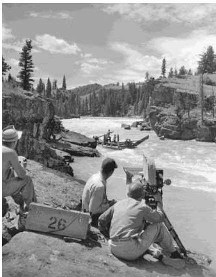
Figure 7 — Marilyn Monroe was rescued by a lifeguard and Robert Mitchum during the filming of The River of no Return .

Another Hollywood star who performed a couple of drowning rescues was Johnny Weissmuller, a gold medal Olympic champion in swimming before starring in Tarzan films. The first incident occurred in 1926 when he was swim training in