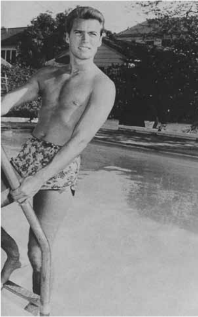
Figure 2 — Clint Eastwood has worked as actor and as a lifeguard.