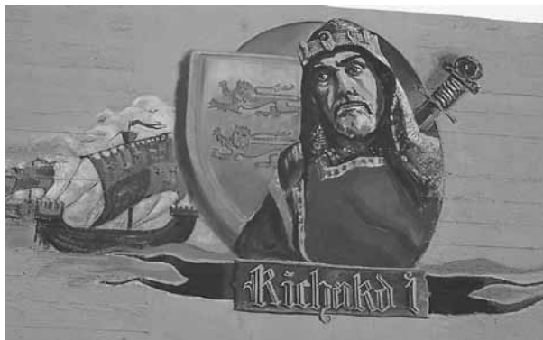
Figure 1 — Sean Connery has acted in many Hollywood films, and he has worked as a lifeguard. Sean Connery on wall painting depicted as Richard I of England (Wikipedia, 2008e).