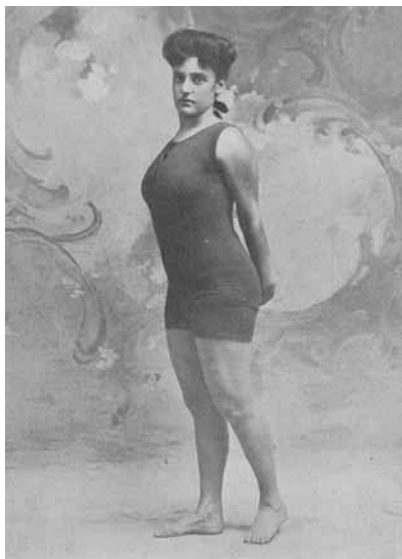
Figure 10 — Annette Kellermann was a swimmer, actress, writer, inventor of synchronized swimming, and pioneer of women's swimwear. This image was created in Australia and is now in the public domain.

Aileen Riggin Soule was an elite aquatic athlete and later a Hollywood film star. She was the youngest and tiniest U.S. Olympic champion and the first women's