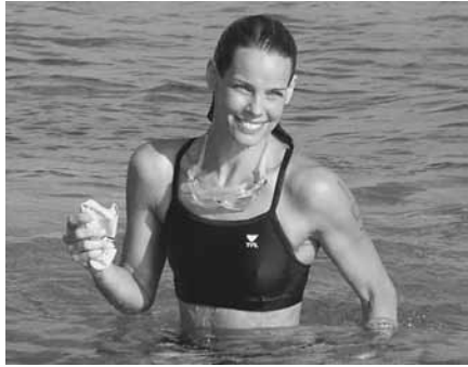
Figure 3 — Alexandra Paul has worked as actress and lifeguard. Alexandra competing in the Bonaire EcoSwim 10K race