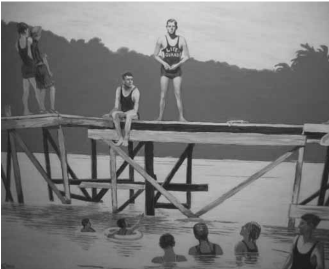
Figure 4 — Ronald Reagan worked as a lifeguard when he was teenager. Illustration drawn by Fran Swarbrick. Taken from Senville (2008) with permission.