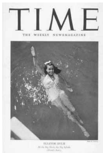
Figure 12 — Eleanore Holme was a competitive swimmer and Hollywood actress. Taken from Wikipedia (2008h). This work is in the public domain.