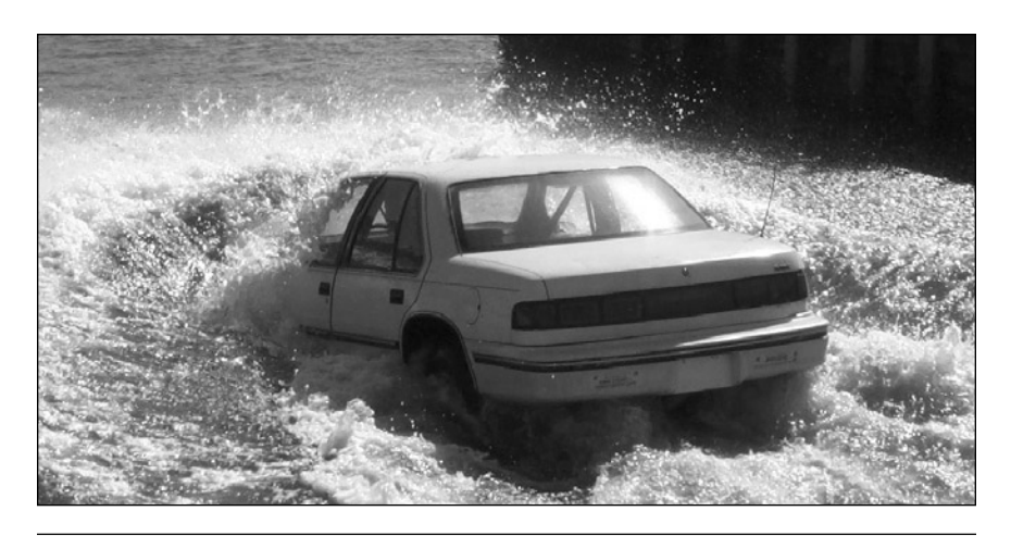
Figure 1 — Automobile unexpectedly entering deep water.