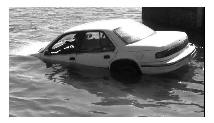
Figure 3 — The need to escape a partially submerged vehicle rapidly is especially important in water more than 4 m (14 ft) deep, in which vehicles often invert, causing disorientation of submerged passengers and decreasing their likelihood of escape and survival.

The decision to escape the vehicle must be made as soon as the vehicle leaves the road and enters the water. If the occupants delay their escape from the vehicle and the vehicle begins to sink, it might not be possible to make an escape until the water pressure has equalized inside the vehicle. In addition, should the vehicle land in deep water that is less than 4 m (14 ft), the vehicle will usually come to rest on the bottom on all four wheels, assuming there are no large rocks or other debris on the bottom. Water depths greater than 4 m (14 ft) usually result in the vehicle "turning turtle" and landing on its roof (Figure 3). Needless to say, being upside down in a dark environment with water rushing in completely disorients the occupants of the vehicle.