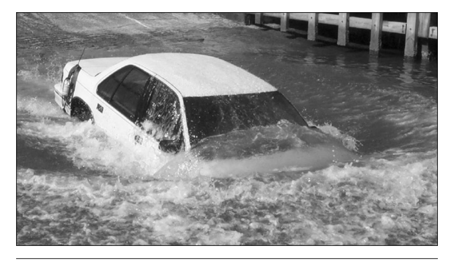
Figure 2 — It is critical to escape from a vehicle that has entered the water within the first 30 s to 4 min.

Factors that affect the float time include closed, sealed, and intact windows and weather seals. Because the motor is located in the front of most vehicles, the vehicle will immediately assume an angled nose-down position in the water.