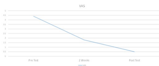
Figure 1: VAS data collected from the subject before the training schedule (pre-test), at 2 weeks into the training schedule, and after the 4-week training schedule (post-test).