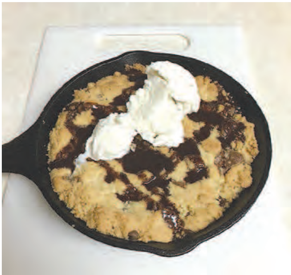
A finished product of Jacob's cookie skillet, topped with melty ice cream and Hershey's syrup.

9 Garnish the cookie with a great big scoop of vanilla ice cream, drizzle with the chocolate syrup and serve with two spoons or one if you feel!