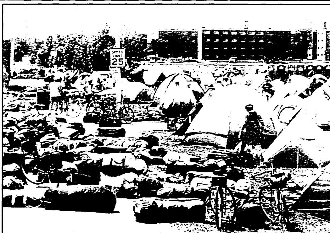
A tent city arose on the grounds surrounding the football stadium June 22-23 as approximately 3,000 cyclists camped in Bowling Green while taking part in the 5th Annual Great Ohio Bicycle Adventure. The week-long, 350-mile tour of northwest Ohio began in Van Wert and other camp sites included Defiance, Wauseon, Bluffton and Wapakoneta. Riders were able to visit a wide variety of attractions along the way such as Harrison Lake State Park, Sauder Village, Oak Openings Metro Park, Maumee Bay State Park and the Neil Armstrong Air and Space Museum.