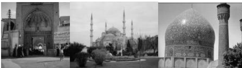
Figure 5. Masjid Universiti Teknologi Malaysia with the copied elements: Blue Gate in Iran, the Tower of Turkey's Blue Mosque and the Dome of the Masjid-i Shah in Isfahan.