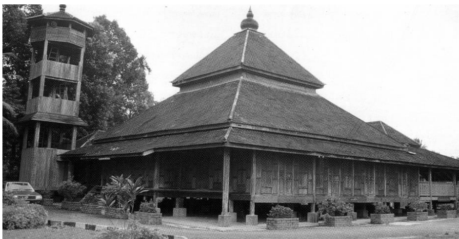
Figure 1. This mosque, Masjid KampungLaut, is considered the oldest in Malaysia. It requires more documentation and a search on the history and background of its establishment.

when and how Masjid KampungLaut was built.