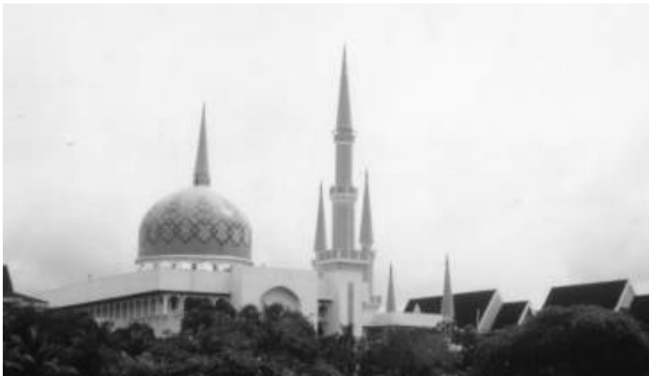
Figure 4. Masjid Universiti Teknologi Malaysia is an example of how the issue of implementation is a symbol of architectural styles.