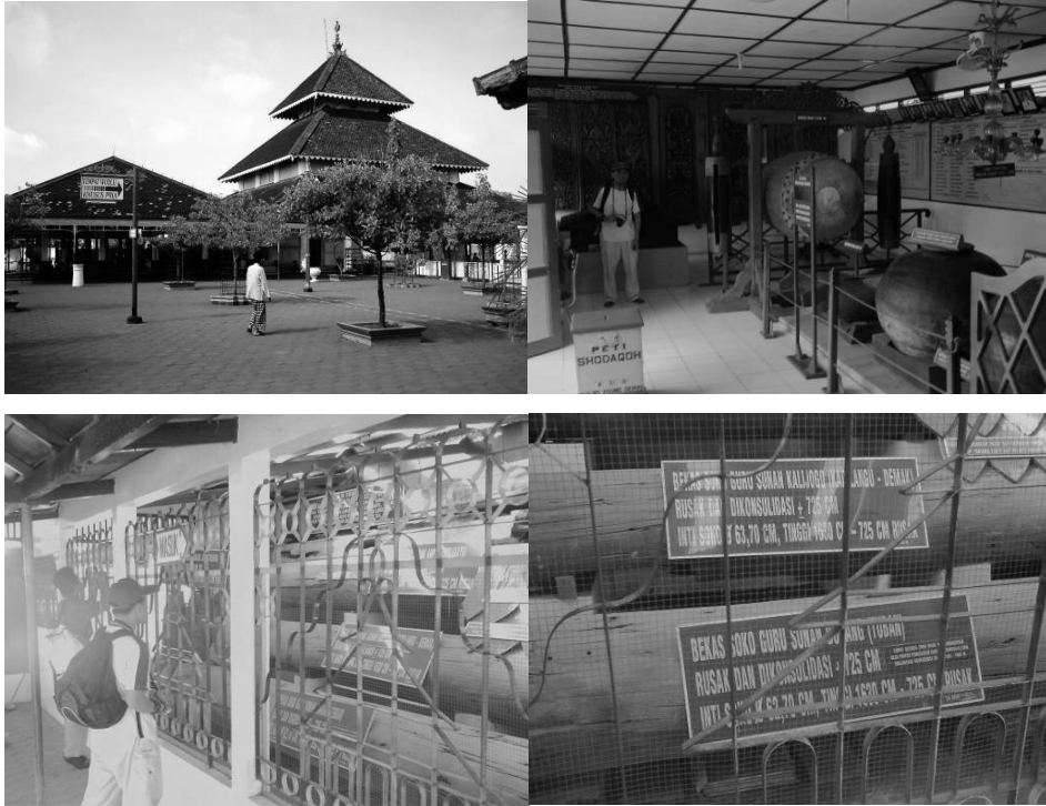
Figure 2. Some of the documentation is done at the mosque of Demak to clarify the history and development of this historic mosque.

After the process of documentation, an equally important process in the study of architecture history and theory development is classification. Classification is an attempt to classify data into a larger collection that has the same characteristics and the same principles.