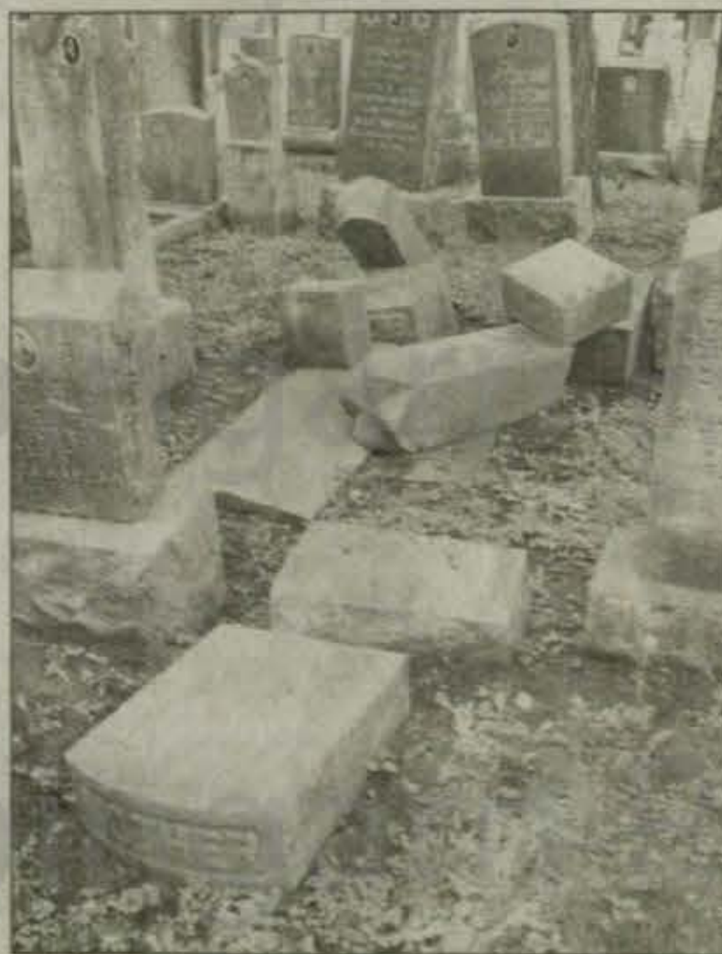
Eden Memorial Park Cemetery has been accused of digging up the remains of those buried and losing the remains.