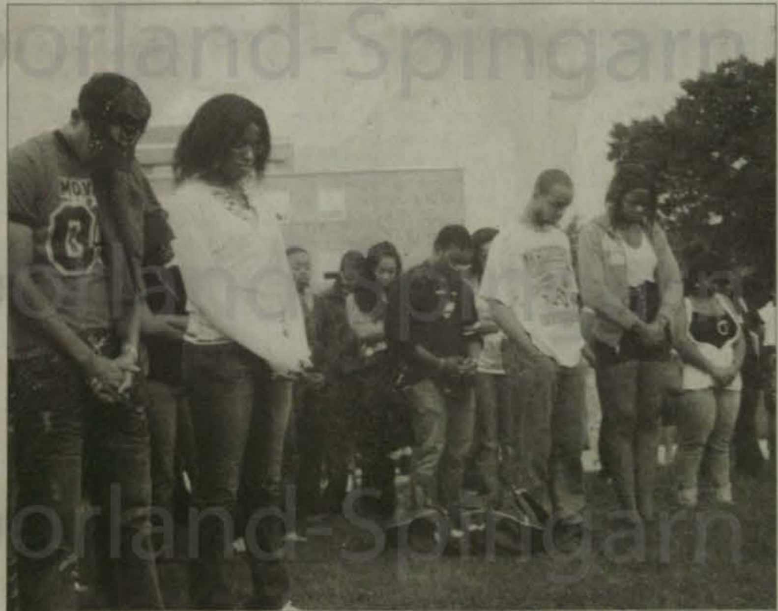
Students united at the flagpole Friday afternoon, standing for change and remembering those in their lives who were taken away through gun violence.

Signs were viewed by passengers in cars reading, "Honk for peace," and "Break the silence; no more gun violence."