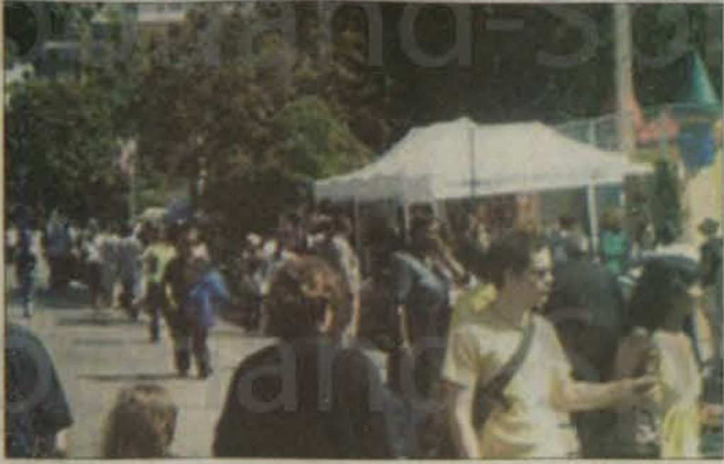
Hundreds of people gather on U Street to partake in the weekend festivities.