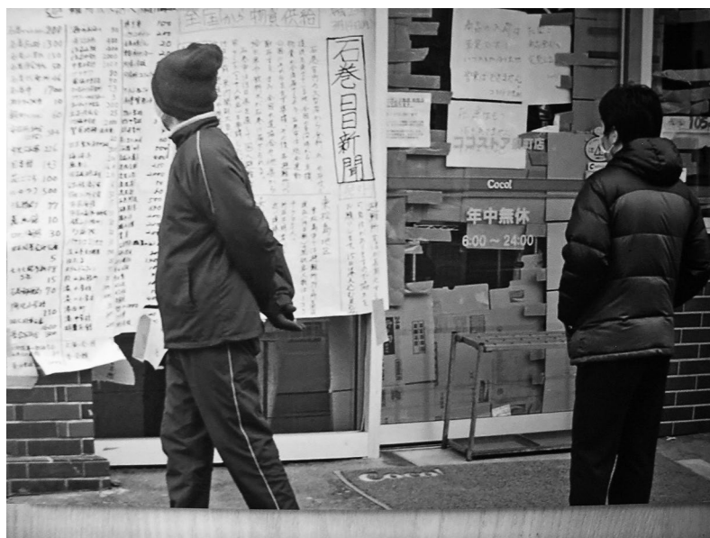
Figure 3 The handwritten newspaper at one of the evacuation centers (photo taken at the Ishinomaki Nyūze)