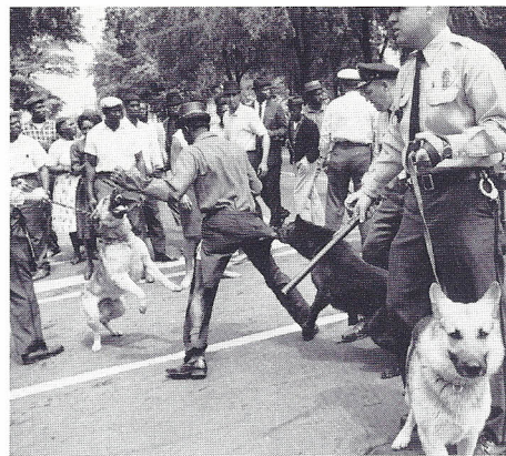
BY CHARLES MOORE, 1963