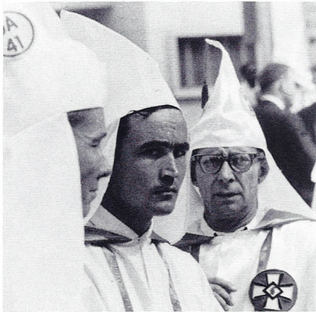
BY DOUG HARRIS, 1965