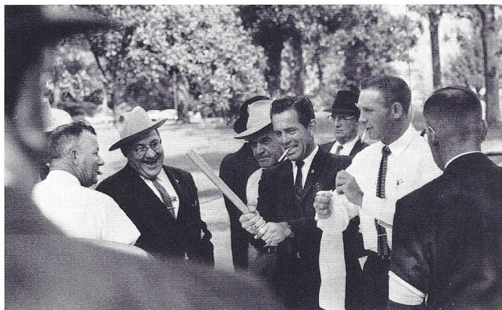
BY CHARLES MOORE, 1962